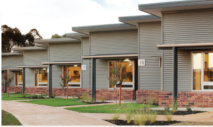
Corella Place Transitional Facility, Ararat