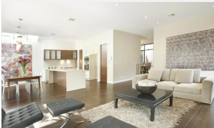
Mountview Road Private Residence, Malvern