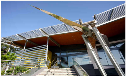
Caloundra Courthouse & Watchhouse, Caloundra