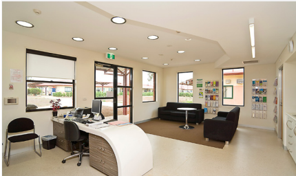
Dame Phyllis Frost Centre, Ravenhall